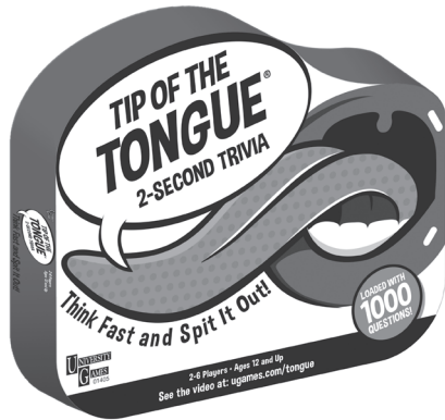
TIP OF THE TONGUE® 2-6 Players, Ages 12+

The first player to reach FINISH on the Game Board wins the game.