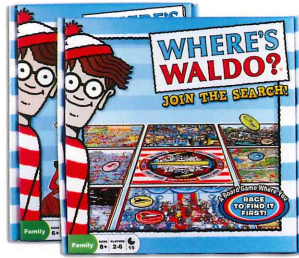
Where's Waldo? Board Games