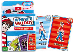
Where's Waldo? Card Games

SEARCH FOR OTHER WHERE'S WALDO? GAMES AND PUZZLES!