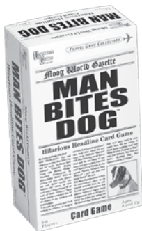
Man Bites Dog™ Card Game

See our entire line of games and puzzles at: