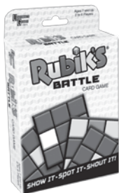
Rubik's® Battle Card Game