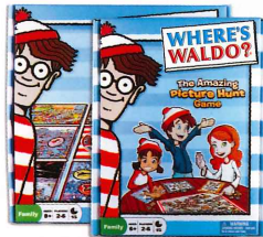
Where's Waldo? Board Games