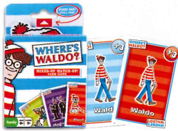
Where's Waldo? Card Games