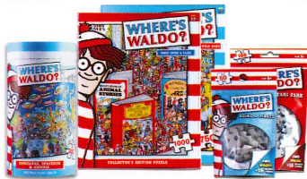
Where's Waldo? Puzzle Sets