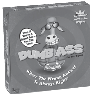
DUMB ASS® Ages 14 and Up 2 to 6 Players

See our entire line of games and puzzles at: