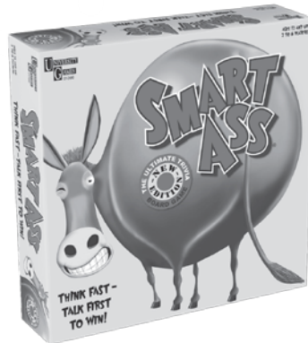
SMART ASS® Ages 12 and Up 2 to 6 Players