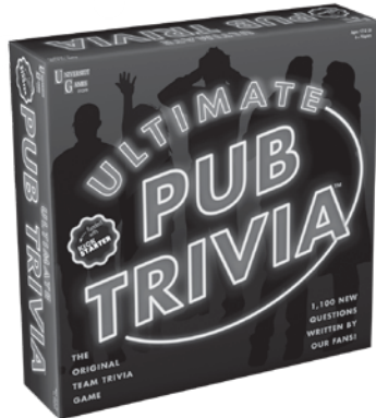
ULTIMATE PUB TRIVIA™ Ages 12 and Up 4 or More Players