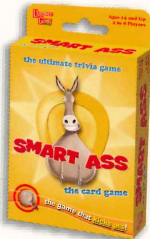
Smart Ass™ Card Game Ages 12 & Up