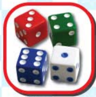
Red, Blue, Green, and White Dice