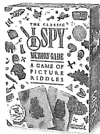
I Spy™ Memory

Look for these games at a retailer near you or at: