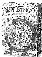
I Spy™ Bingo