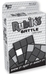
Rubik's® Battle Card Game