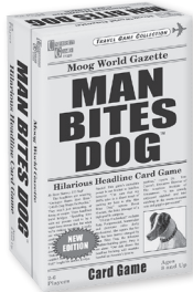
Man Bites Dog™ Card Game

See our entire line of games and puzzles at: